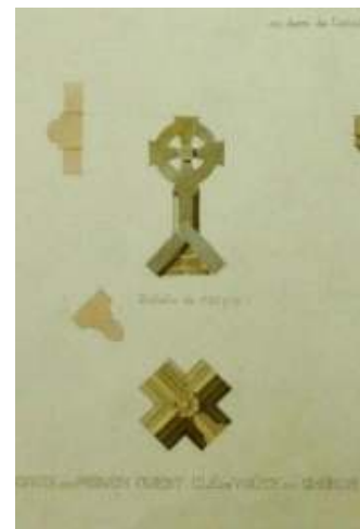
Three-dimensional survey of the cross on top of the facade