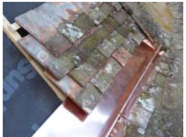
Testing the triangular-shaped copper gutter