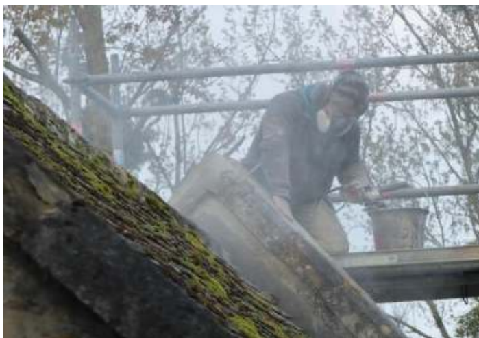
Scraping of the stone joints of the western facade

Inside the chapel a scaffold-on-wheels has been installed to scrutinize the adherence of pictorial layers onto the vaults. The fragile sections have been secured by injections of an appropriate adhesive product. Finally a more recent spread of moss on some paintwork in the choir has been checked by the spraying of a fungicide. Drainage is being studied to channel rain water into a ditch east of the chapel.